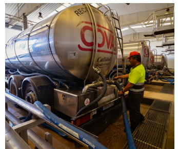
4. Milk tanker driver