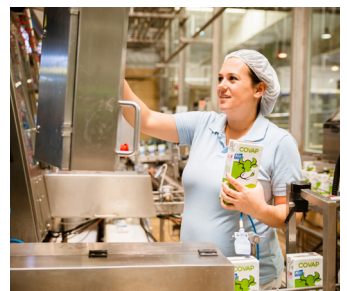
6. Dairy factory technician