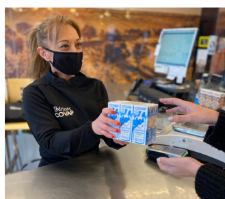
7. Shop assistant