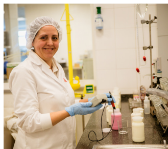
5. Lab technician