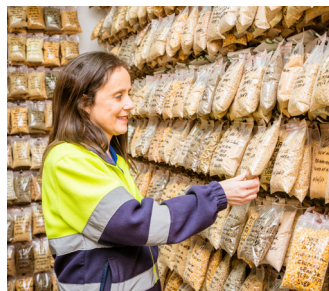
3. Animal nutritionist